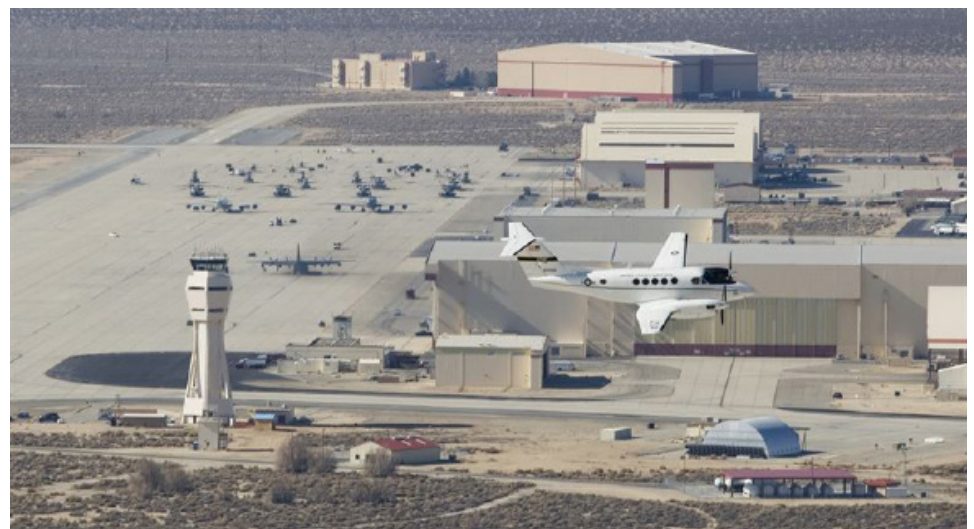
An aerial view of Edwards Air Force Base, one of the original seven pilot installations with an IEP completed in FY 2019.