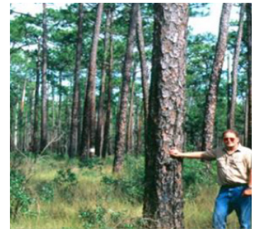
Top left: the Perennial Knawel. Top right: an F-35. Bottom left: Water sampling. Bottom right: a longleaf pine forest.